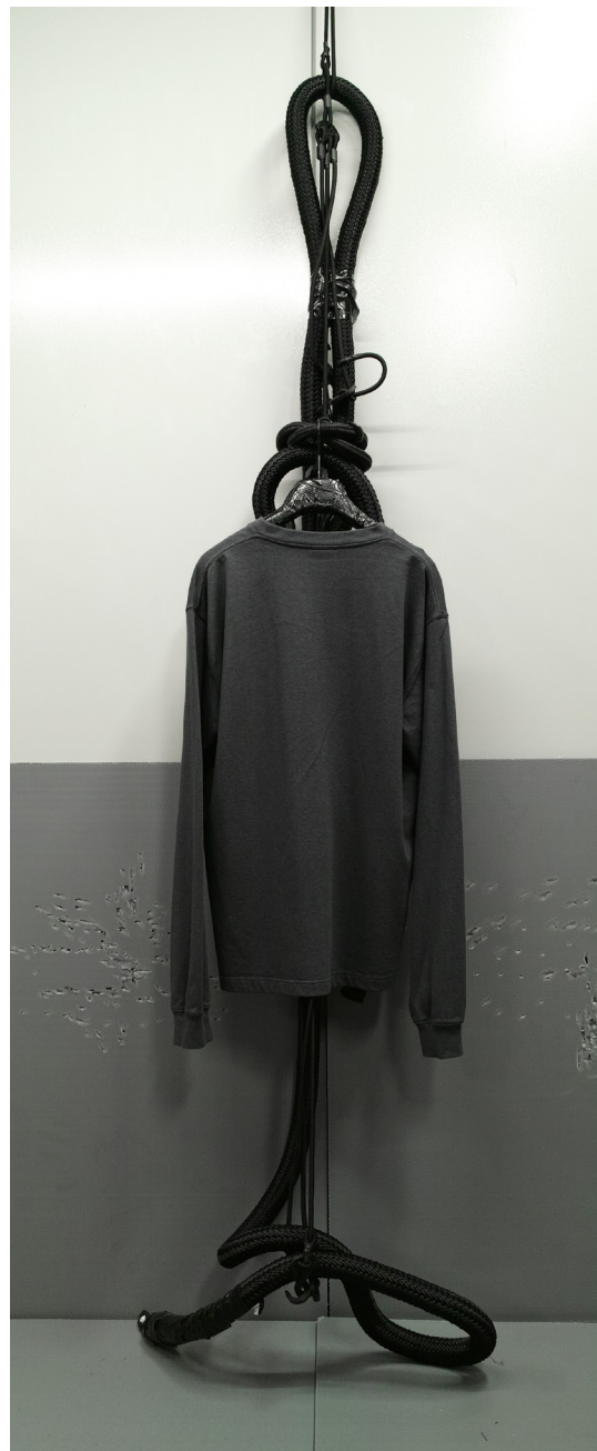
SS21_GR016_ANT / ALL SEASONS UTILITY_LONG-SLEEVE_T-SHIRT COLOUR: ANTRACITE SAMPLE SIZE: L WHOLE SALE PRICE: 48,00 €