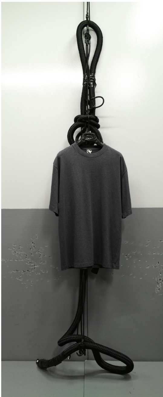
SS21_GR015_ANT / ALL SEASONS UTILITY_SHORT-SLEEVE_T-SHIRT COLOUR: ANTRACITE SAMPLE SIZE: L WHOLE SALE PRICE: 44,00 €