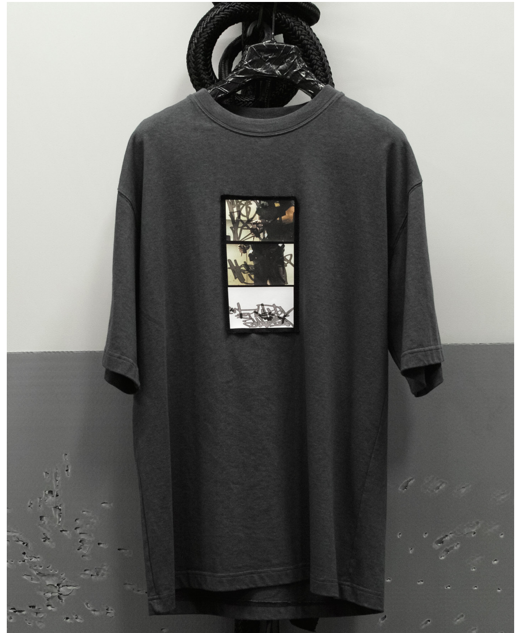
SS21_GR017WP_ANT / ALL_SEASONS_UTILITY_SLEEVE_LESS T-SHIRT WITH PATCH COLOUR: ANTRACITE SAMPLE SIZE: L WHOLE SALE PRICE: 53,00 €