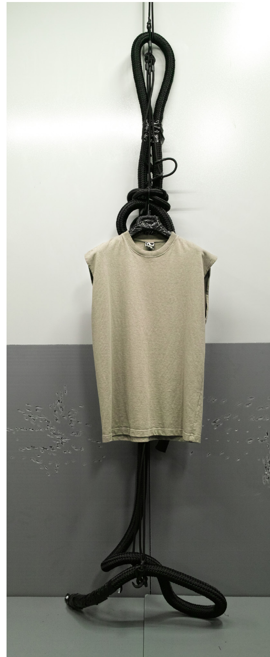
SS21_GR017_TAU / ALL_SEASONS_UTILITY_SLEEVE_LESS T-SHIRT COLOUR: TAUPE SAMPLE SIZE: L WHOLE SALE PRICE: 43,00 €