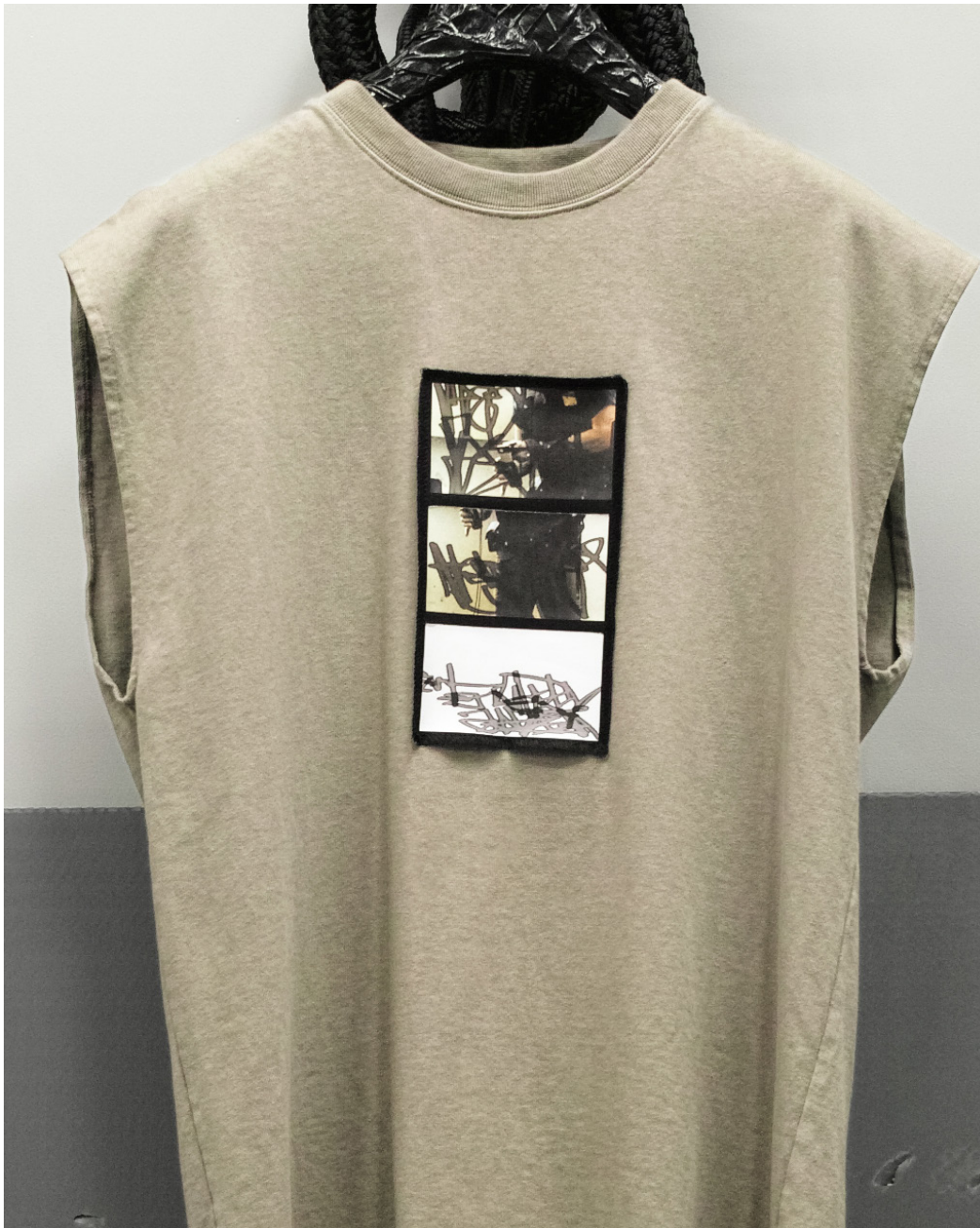
SS21_GR017WP_TAU STYLE: ALL_SEASONS_UTILITY_SLEEVE_LESS T-SHIRT WITH PATCH COLOUR: TAUPE SAMPLE SIZE: L WHOLE SALE PRICE: 53,00 €