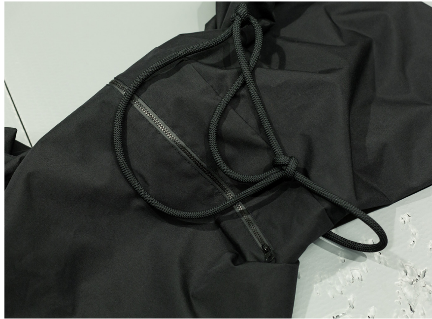
SS21_ACCGR002SMALL_BLK / BV_BAG HOLDER_SMALL COLOUR: BLACK SAMPLE SIZE: OS WHOLE SALE PRICE: 48,00 €

SHAPE IS BASED ON A MILITARY BIVI BAG CONTAINER FABRIC IS CORDURA 300 F3R3 SACK COMES IN TWO SIZES. BIG: 55 CM X 60 CM