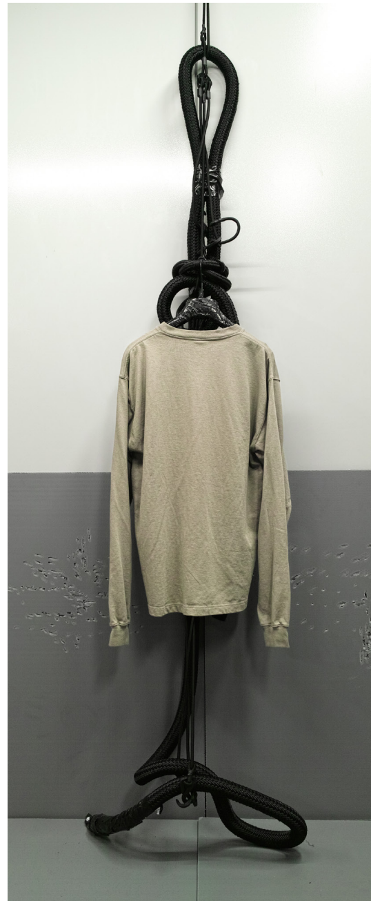
SS21_GR016_TAU / ALL_SEASONS_UTILITY_LONG-SLEEVE_T-SHIRT COLOUR: TAUPE SAMPLE SIZE: L WHOLE SALE PRICE: 48,00 €