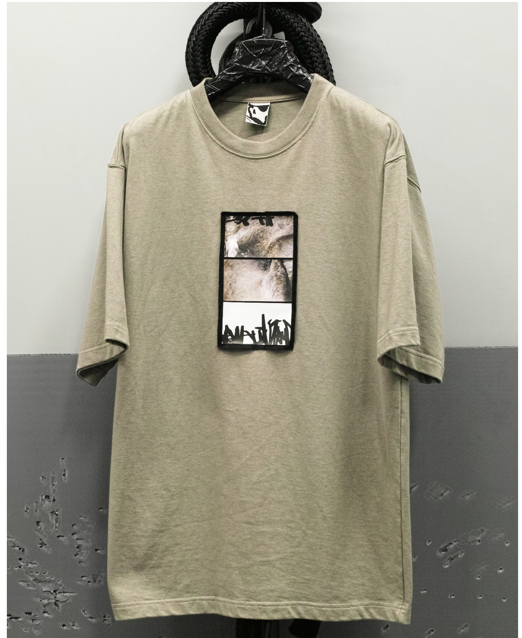
SS21_GR015WP_TAU / ALL_SEASONS_UTILITY_SHORT-SLEEVE_T-SHIRT WITH PATCH COLOUR: TAUPE SAMPLE SIZE: L WHOLE SALE PRICE: 55,00 €