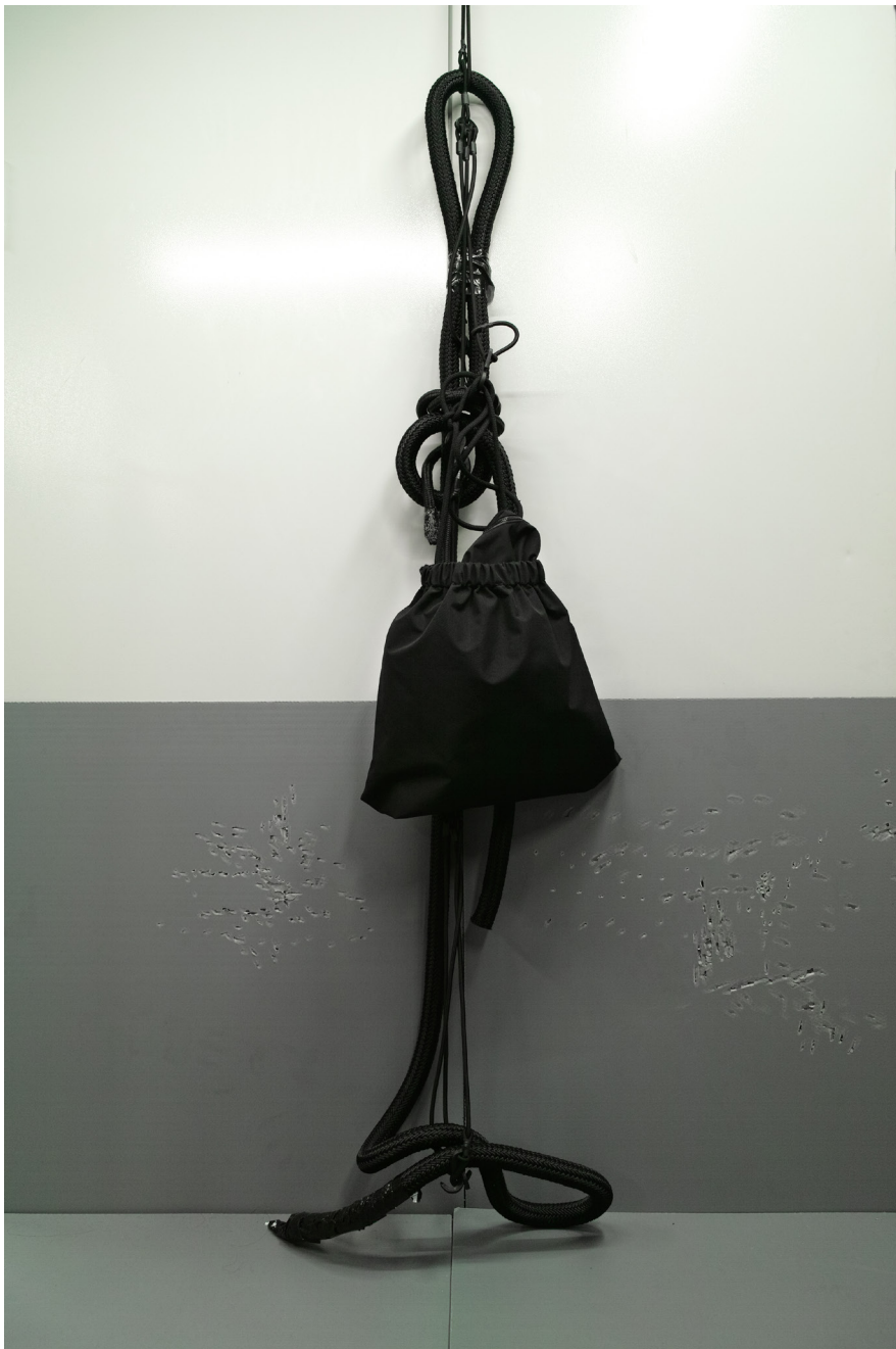
SS21_ACCGR002BIG_BLK / BV_BAG HOLDER_BIG COLOUR: BLACK SAMPLE SIZE: OS WHOLE SALE PRICE: 58,00 €

SHAPE IS BASED ON A MILITARY BIVI BAG CONTAINER FABRIC IS CORDURA 300 F3R3 SACK COMES IN TWO SIZES. BIG: 55 CM X 60 CM