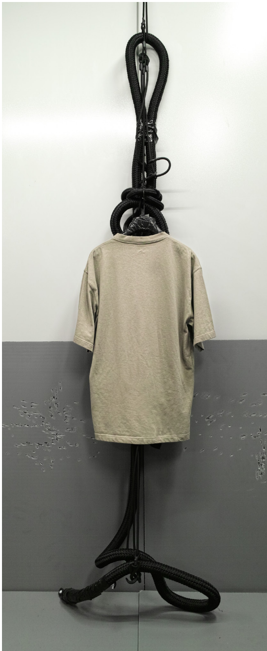
SS21_GR015_TAU / ALL_SEASONS_UTILITY_SHORT-SLEEVE_T-SHIRT COLOUR: TAUPE SAMPLE SIZE: L WHOLE SALE PRICE: 44,00 €