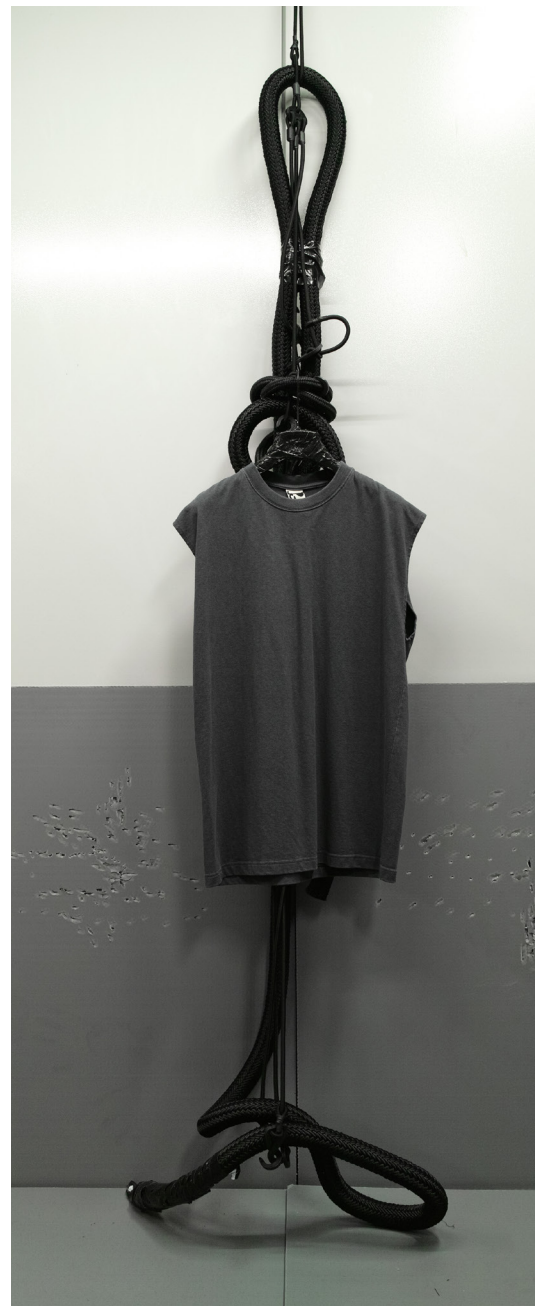
SS21_GR017_ANT ALL SEASONS UTILITY_SLEEVE_LESS T-SHIRT COLOUR: ANTRACITE SAMPLE SIZE: L WHOLE SALE PRICE: 43,00 €