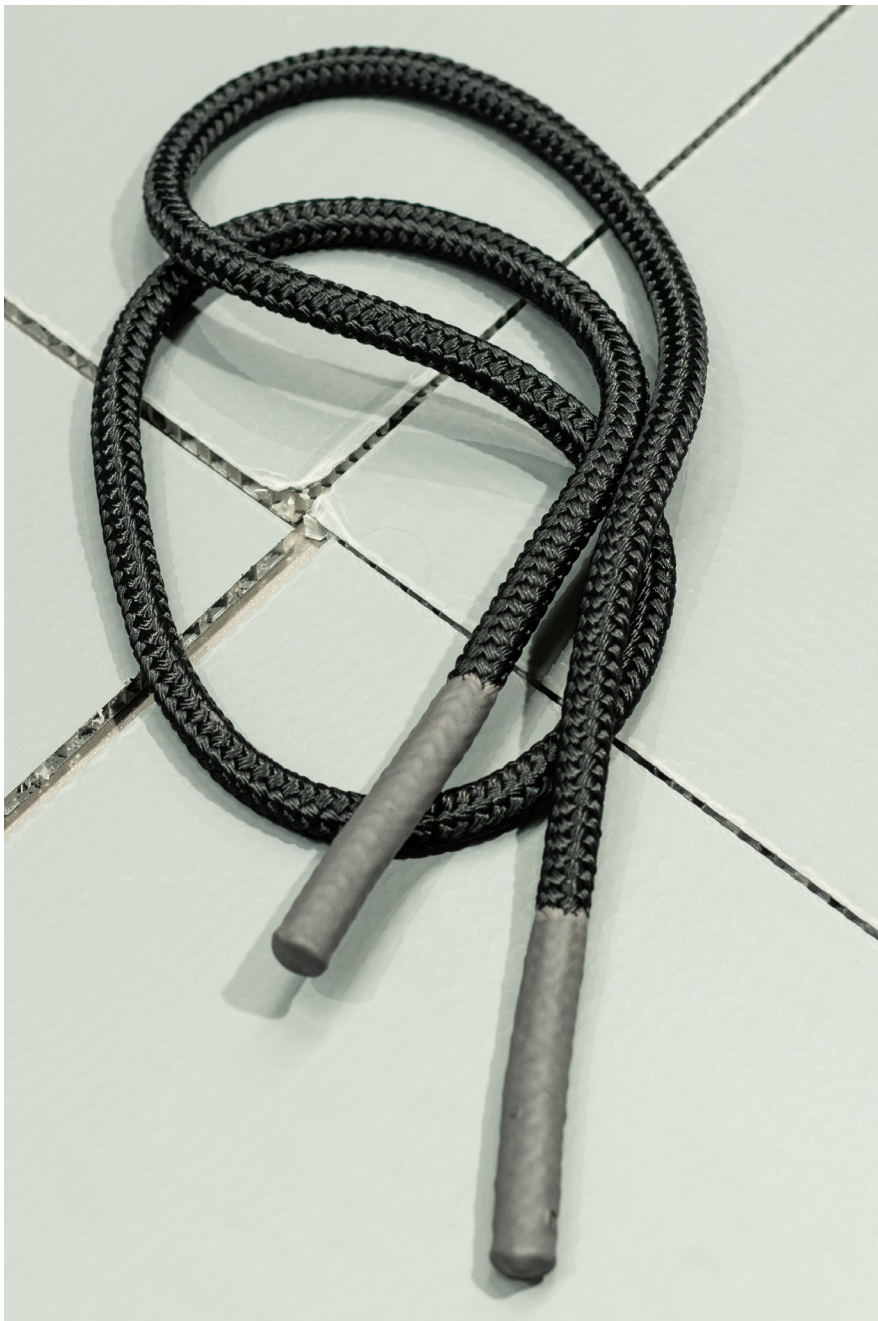
SS21_ACCGR001_1_BLK / BOUNDFREE-BELT COLOUR: BLACK SAMPLE SIZE: OS WHOLE SALE PRICE: 18,00 € ROUND 1 CM ROPE WITH DIPPED ENDS