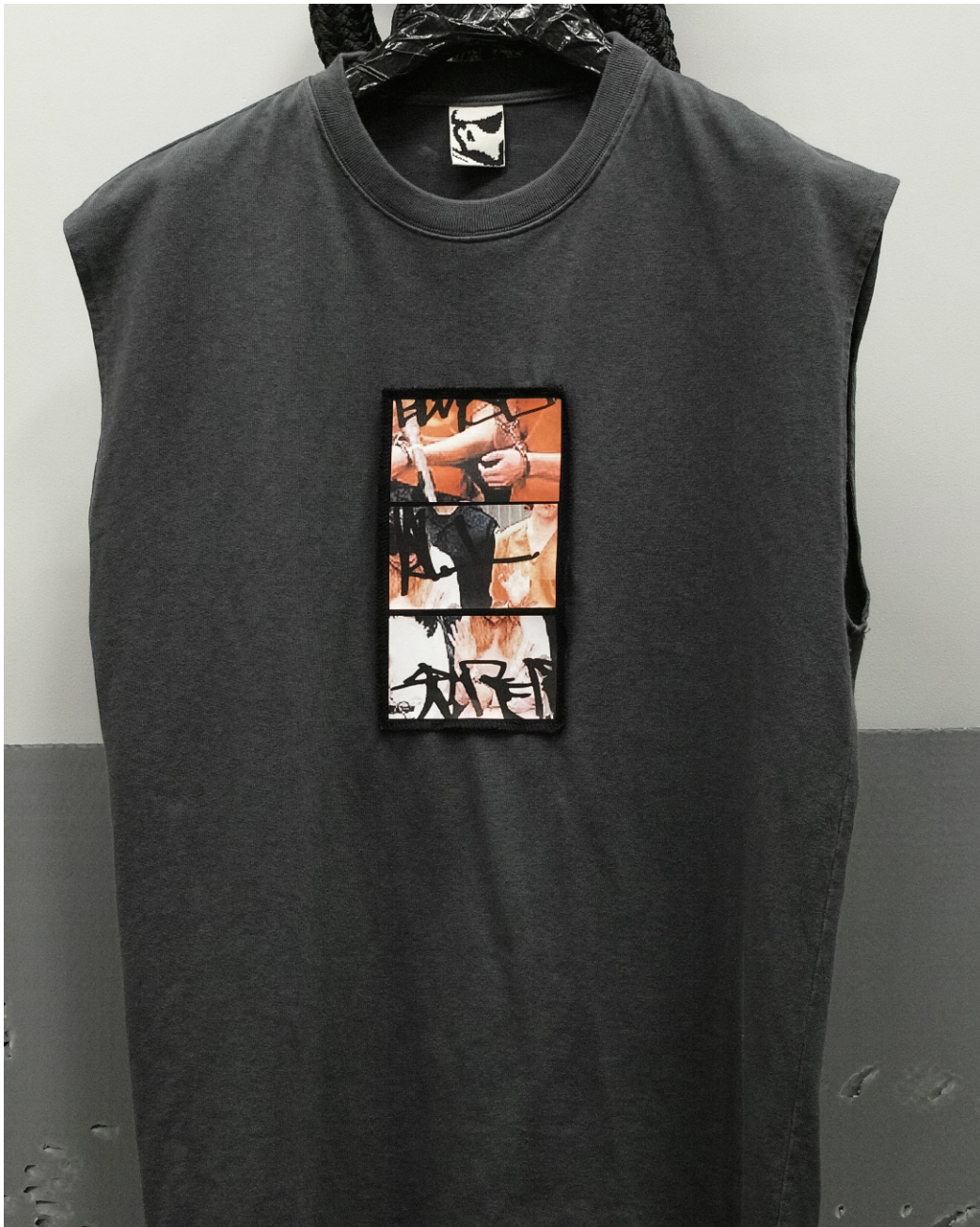
CODE: SS21_GR017WP_ANT STYLE: ALL_SEASONS_UTILITY_SLEEVE_LESS T-SHIRT WITH PATCH COLOUR: ANTRACITE SAMPLE SIZE: L WHOLE SALE PRICE: 53,00 €